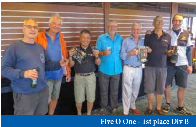
Five O One - 1st place Div B