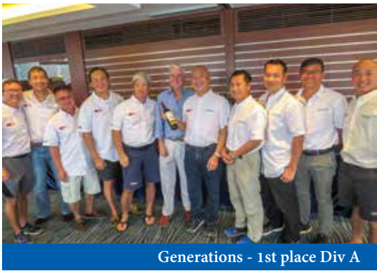
Generations - 1st place Div A