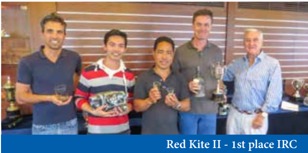
Red Kite II - 1st place IRC