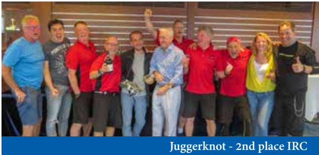
Juggerknot - 2nd place IRC