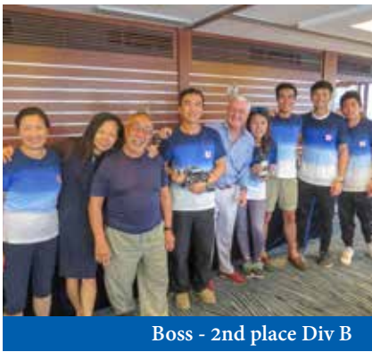
Boss - 2nd place Div B