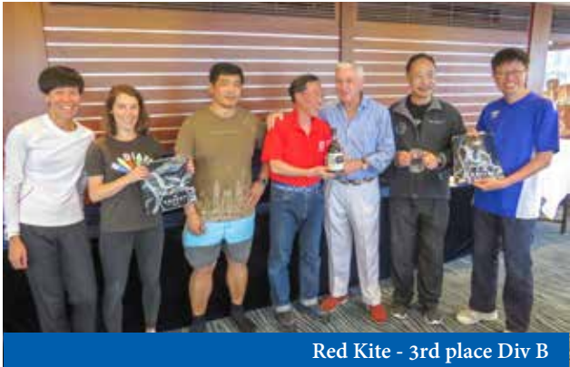
Red Kite - 3rd place Div B