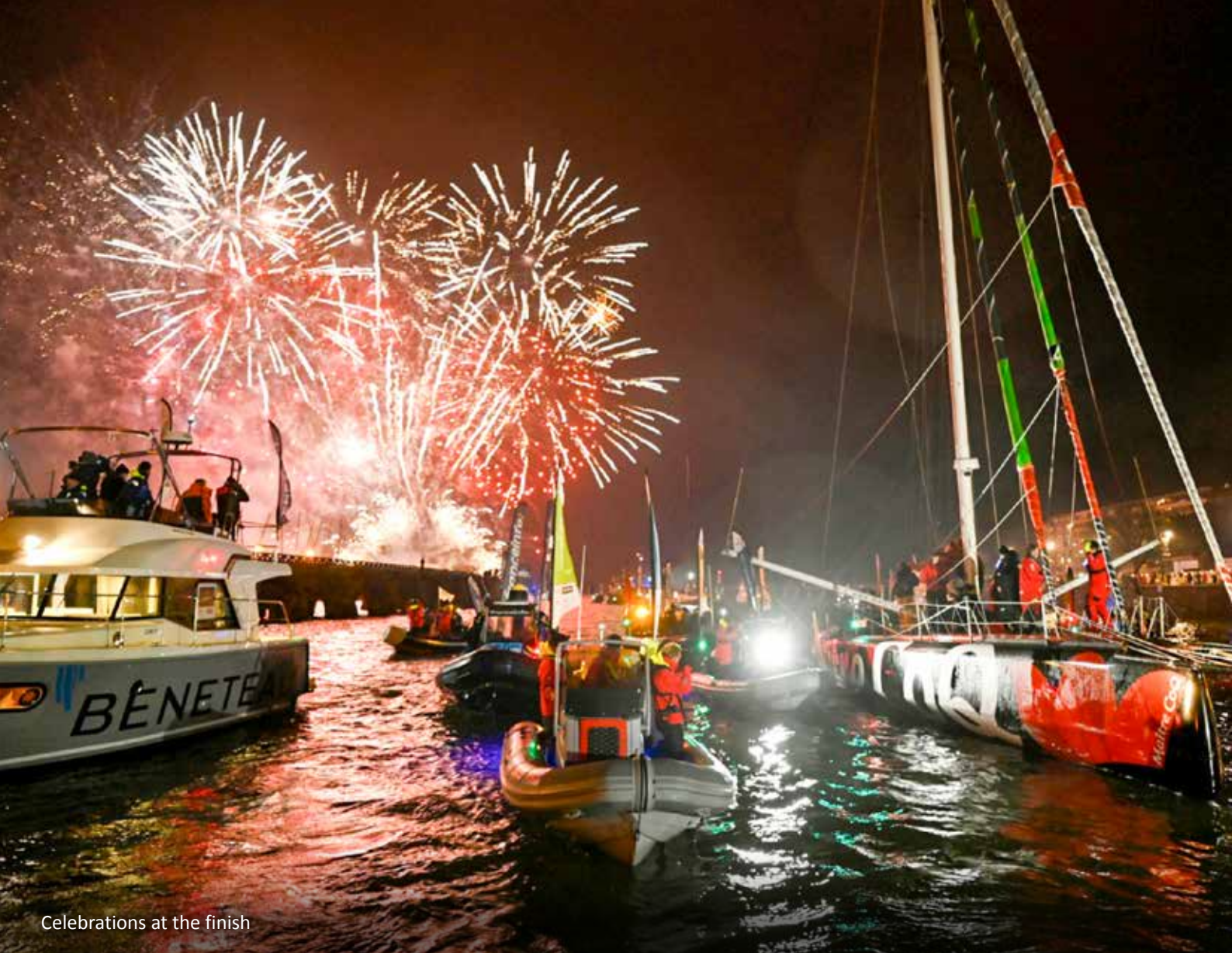
Celebrations at the finish

Over an ocean racing career spanning nearly 20 years Bestaven has tasted success in the Mini class, winning the Mini Transat in 2001, and then in the Class 40 where he twice won the Transat Jacques Vabre. In the 2008 Vendée Globe he was dismasted in the Bay of Biscay and had to retire within 24 hours of the start. He has taken his time to return to the Vendée Globe but came back with a well-appointed, but small team of specialists from all fields including the America's Cup.