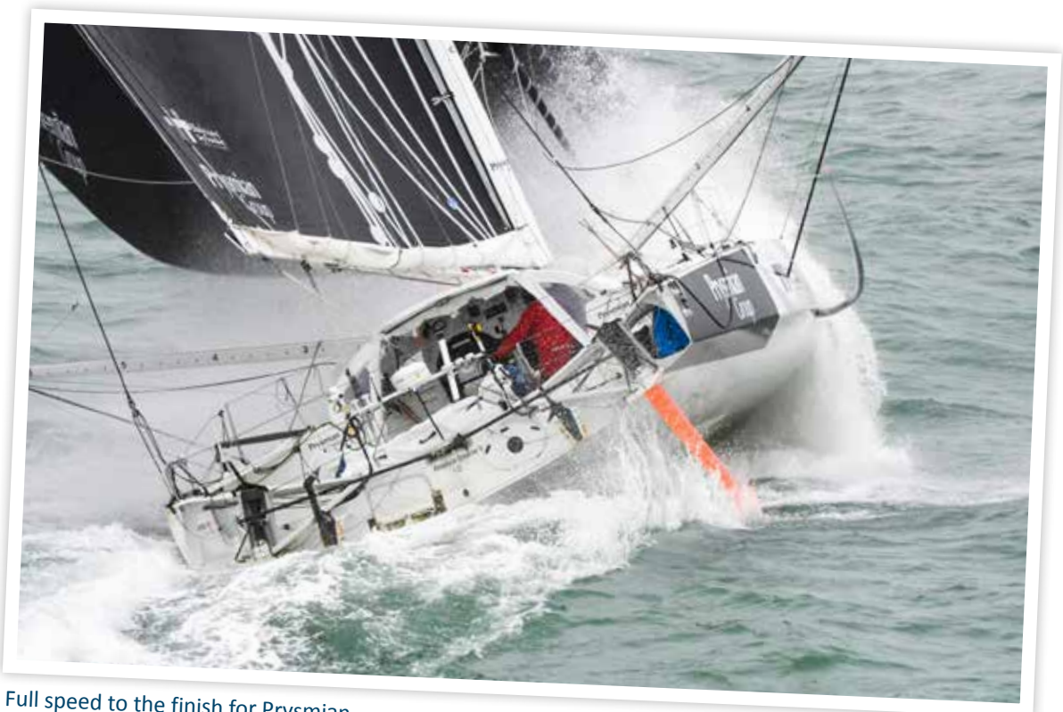
Full speed to the finish for Prysmian