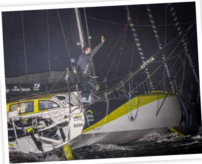
Charlie Dalin crosses the line

Bestaven finished in light Biscay drizzle on a two metre swell in 20 knots of westerly wind before being warmly welcomed back to the Les Sables d'Olonne channel where well wishers lined the balconies and streets to acclaim the new winner of the Vendée Globe. Although he was not tipped among the possible winners of the race, Bestaven revealed himself as an outstanding sailor on his first time in the southern oceans where he was at his best in the Indian Ocean, passing Australia's Cape Leeuwin in third place and then in the Pacific, emerging first at Cape Horn with a 15 hour lead.