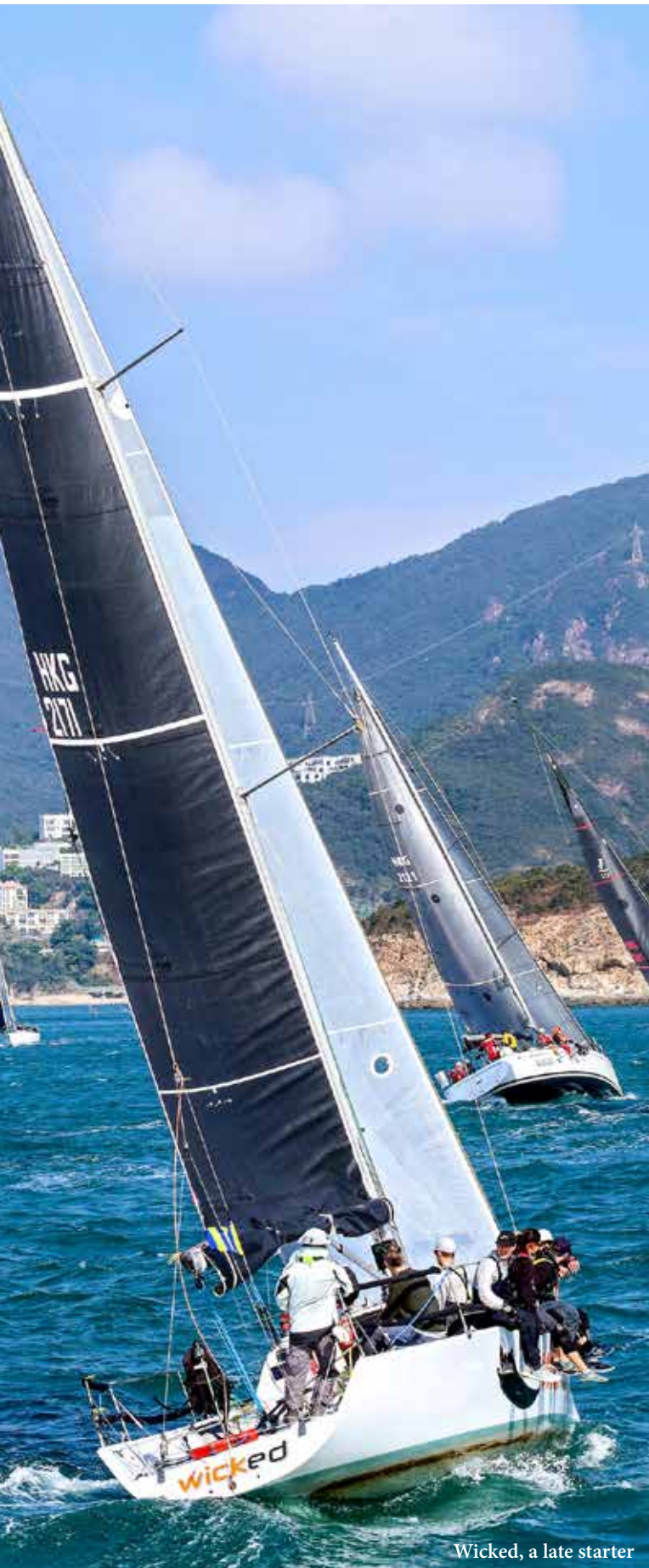
Wicked, a late starter