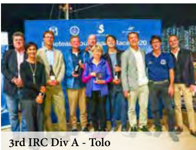
3rd IRC Div A - Tolo