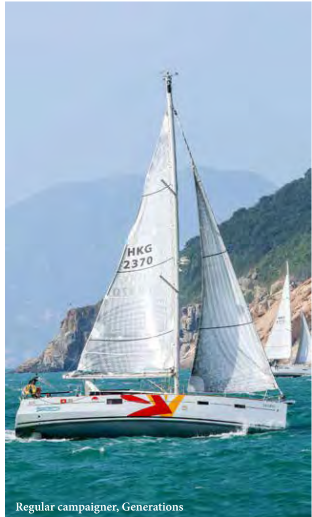
Regular campaigner, Generations

Given the recent holidays, the 14-boat turnout was better than expected, particularly since some crews opted to prepare for the following weekend's Beneteau Four Peaks Race instead. A pity, as they missed a great day on the water . . .