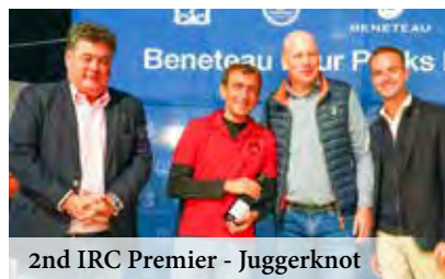
2nd IRC Premier - Juggerknot