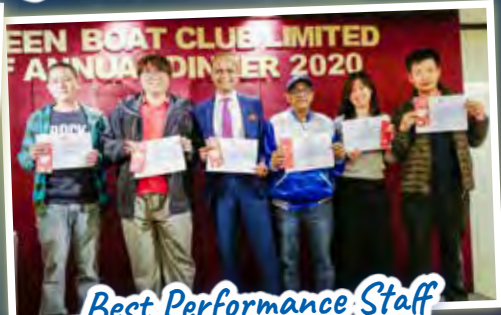
Best Performance Staff