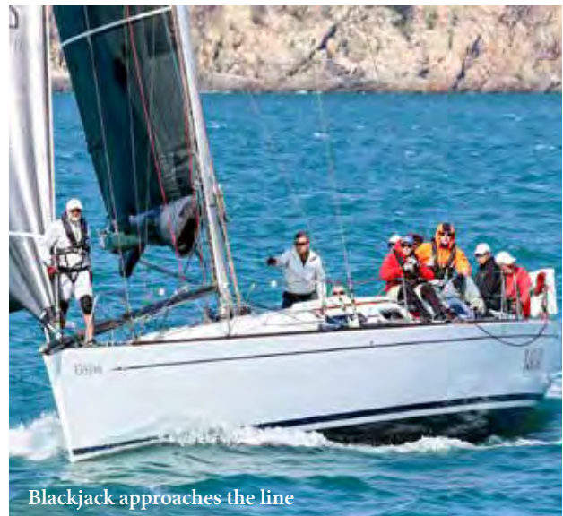
Blackjack approaches the line

In lively conditions, the three IRC 1 and six IRC 2 boats all got away at 1100 in a clean combined start, with Blackjack and Juggerknot leading IRC 1. Ding Dong galloped ahead in IRC 2, with Crystal a late starter. The three boats in HKPN A, and three boats in the B division followed again in a combined start. Five O One led the fleet at the gun, closely followed by the brave and solitary J-80, JeNe PaBe . Blackjack led at the Tai Tam Club Mark but, on the downwind homeward leg, having released its reefed main, was caught out badly rounding the Chesterton Buoy and broached. Neo One went on to take line honours by 48 seconds in a time of 2:49:41 but Blackjack still hung on for handicap honours ahead of both Juggerknot and Neo One .