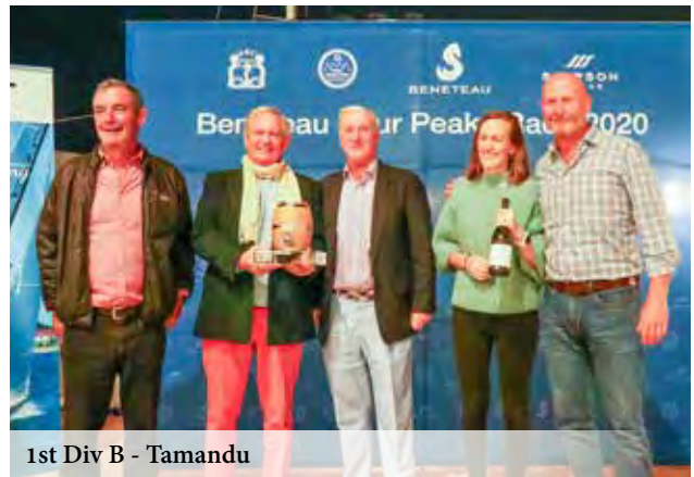
1st Div B - Tamandu

HKPN boats experienced an early morning change of wind conditions, resulting in a parking lot after completing the Twins (Peaks) and final rounding of Chesterman Buoy. The net result: leaders from all divisions approached the finish 9am onwards Sunday morning.