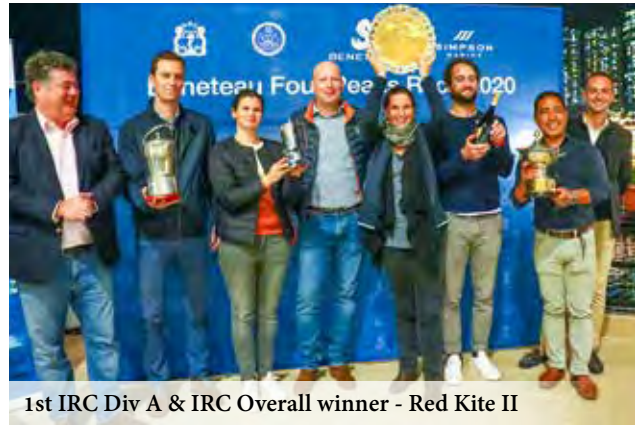
1st IRC Div A & IRC Overall winner - Red Kite II