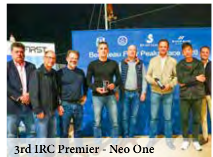
3rd IRC Premier - Neo One