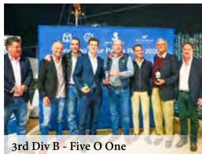
3rd Div B - Five O One