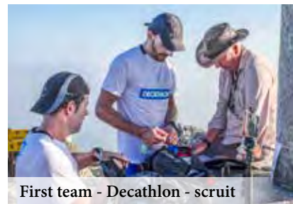
First team - Decathlon - scruit