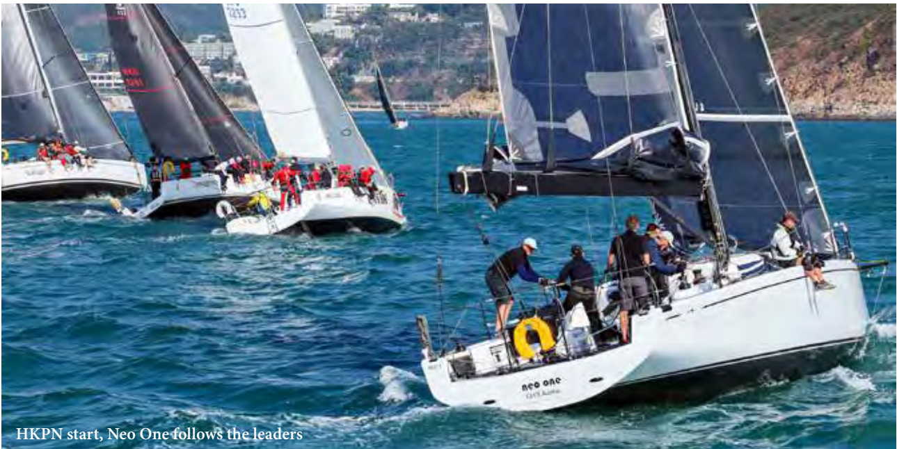
HKPN start, Neo One follows the leaders

In lively conditions, the three IRC 1 and six IRC 2 boats all got away at 1100 in a clean combined start, with Blackjack and Juggerknot leading IRC 1. Ding Dong galloped ahead in IRC 2, with Crystal a late starter. The three boats in HKPN A, and three boats in the B division followed again in a combined start. Five O One led the fleet at the gun, closely followed by the brave and solitary J-80, JeNe PaBe . Blackjack led at the Tai Tam Club Mark but, on the downwind homeward leg, having released its reefed main, was caught out badly rounding the Chesterton Buoy and broached. Neo One went on to take line honours by 48 seconds in a time of 2:49:41 but Blackjack still hung on for handicap honours ahead of both Juggerknot and Neo One .