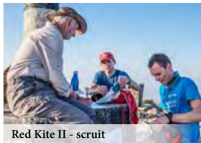
Red Kite II - scruit