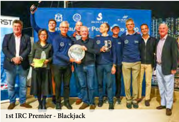
1st IRC Premier - Blackjack