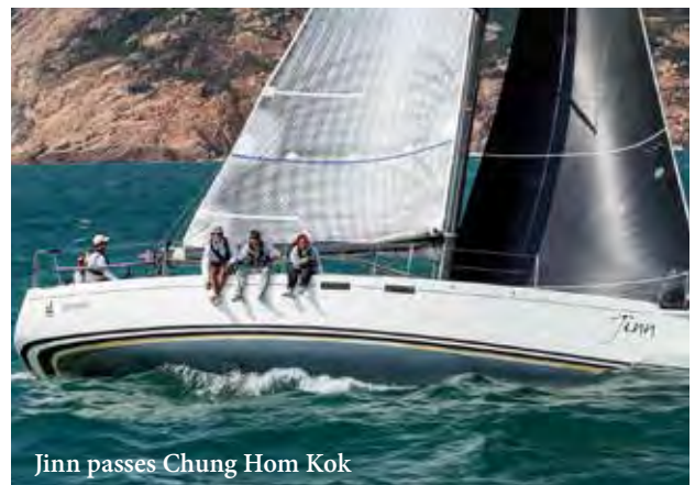
Jinn passes Chung Hom Kok

This included, for both, rounding the windward mark before heading for Chesterton Buoy and passing the Tai Tam Club Mark. IRC then headed for Sung Kong and Shek O Rock whilst the HKPN fleet rounded Fury Rocks. Both fleets then returned passing the Tai Tam Club Mark, Chesterman Buoy and crossing a finish line east of Round Island.