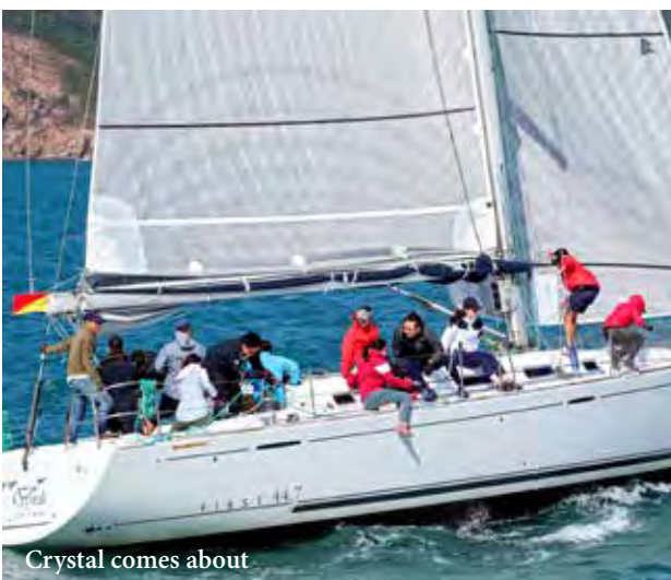
Crystal comes about