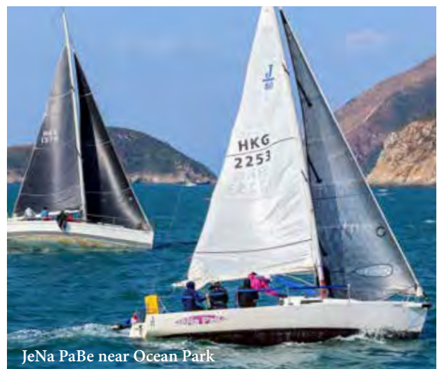
JeNe PaBe near Ocean Park