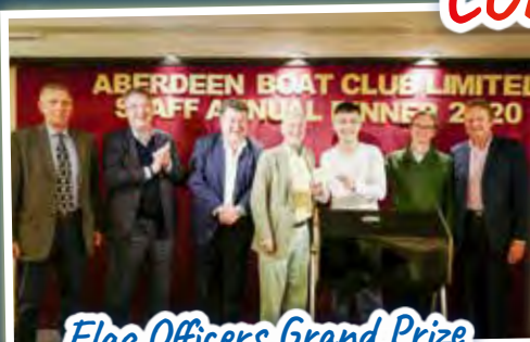
Flag Officers Grand Prize