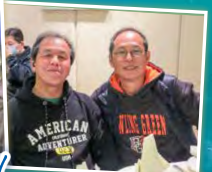
Mask-free is Good to See!