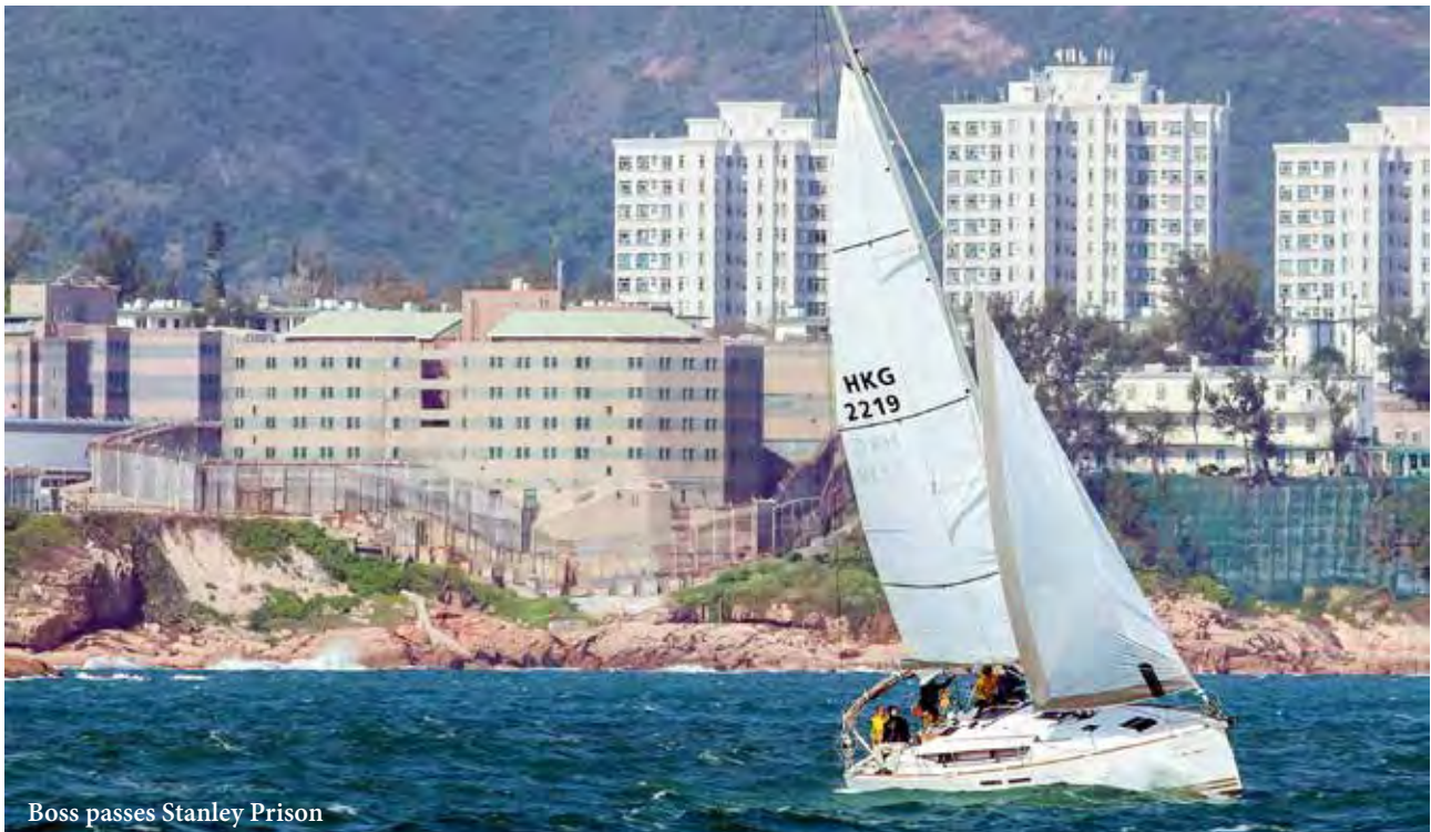
Boss passes Stanley Prison