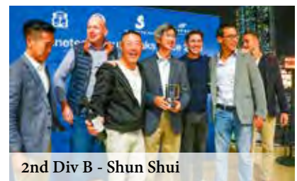
2nd Div B - Shun Shui