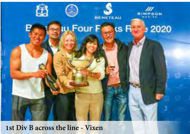
1st Div B across the line - Vixen